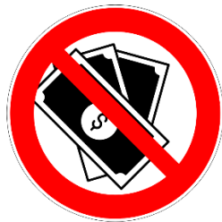
False or counterfeit coin or notes

The following items are not allowed by law to enter the TCI