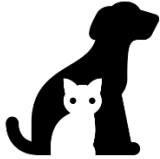
Animals susceptible to rabies or any communicable disease