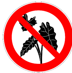
Plants likely to introduce plant disease into TCI

These goods will be either confiscated, a severe fine imposed and/or you could be prosecuted.