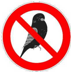
Endangered species of animals