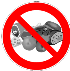
Meat, vegetables or other food unfit for human consumption