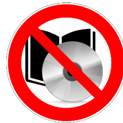
All obscene publications